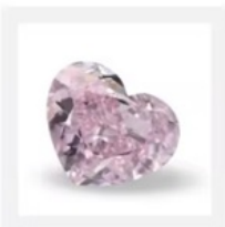
Fancy Color Diamond