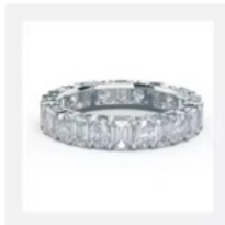
Lab Diamond Ring