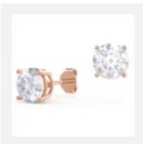
Lab Diamond Earring