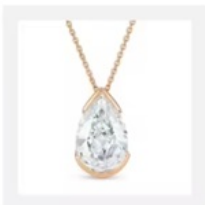
Lab Diamond Necklace