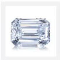
Fancy Shape Diamond