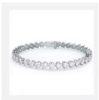
Lab Diamond Bracelet