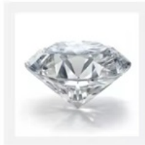
Lab Grown Diamond