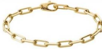
SANTOS DE CARTIER手链