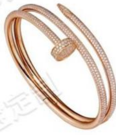
JUSTE UN CLOU 手鐲