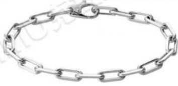
SANTOS DE CARTIER手链