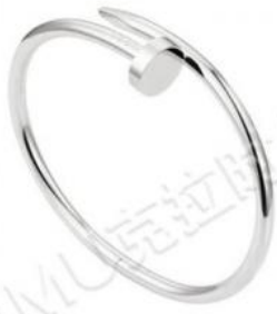
JUSTE UN CLOU 手鐲