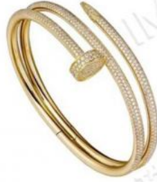
JUSTE UN CLOU 手鐲