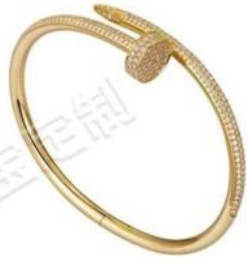
JUSTE UN CLOU 手鐲