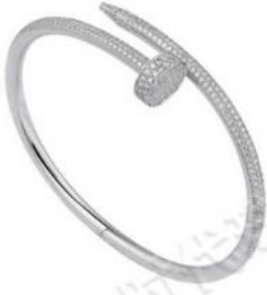
JUSTE UN CLOU 手鐲