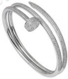
JUSTE UN CLOU 手鐲