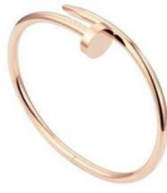
JUSTE UN CLOU 手鐲