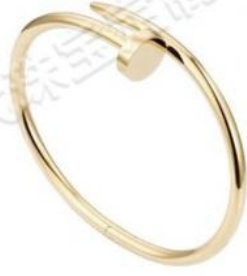
JUSTE UN CLOU 手鐲