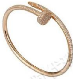
JUSTE UN CLOU 手鐲