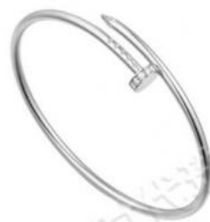
JUSTE UN CLOU手镯