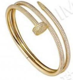
JUSTE UN CLOU手镯