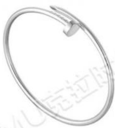
JUSTE UN CLOU手镯