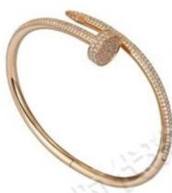
JUSTE UN CLOU手镯