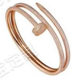
JUSTE UN CLOU手镯