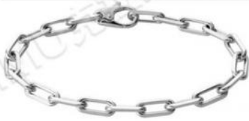
SANTOS DE CARTIER手链