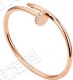
JUSTE UN CLOU手镯