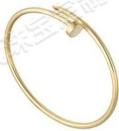
JUSTE UN CLOU手镯