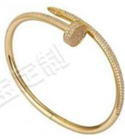
JUSTE UN CLOU手镯