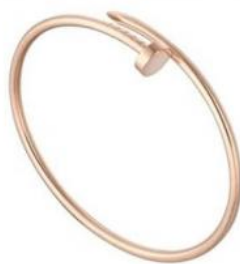
JUSTE UN CLOU手镯