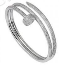
JUSTE UN CLOU手镯