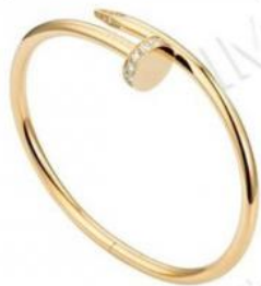
JUSTE UN CLOU手镯