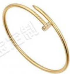
JUSTE UN CLOU手镯