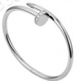
JUSTE UN CLOU手镯