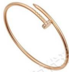
JUSTE UN CLOU手镯