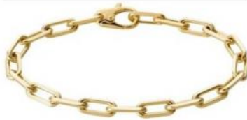
SANTOS DE CARTIER手链