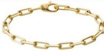
SANTOS DE CARTIER手链