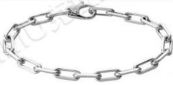
SANTOS DE CARTIER手链